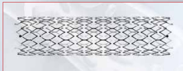
Straight Carotid Stent

SELF-EXPANDING CAROTID STENT with delivery system RX