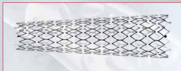
Tapered Carotid Stent