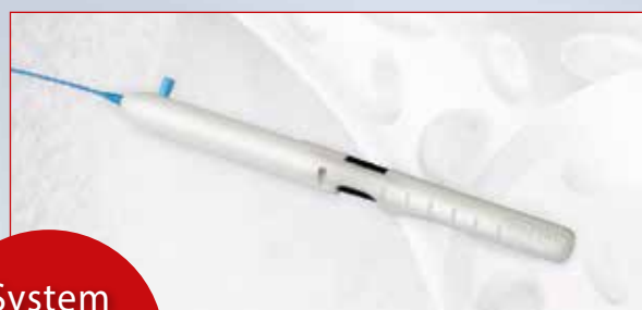
System with handle